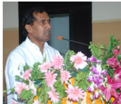
Dr. Shiv Pratap Yadav

The Hon'ble Minister of State, Zoological Gardens, U.P. Dr. Shiv Pratap Yadav , congratulated the Forest Department for 50 Hectare green belt developed in each districts for forest plantation etc in the state. He highlighted the different policies of government in protecting the forests and biodiversity areas of Uttar Pradesh. He cited that actions of government have been initiated such as Lion Safari Park in Etawah.