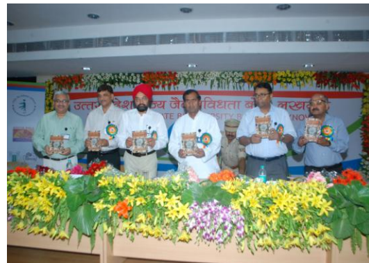
Release of Book on Lichens Diversity in Uttar Pradesh