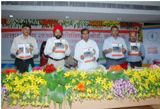
Release of Souvenir on Water and Biodiversity

On this occasion, two books were also released. One was a souvenir on Water and Biodiversity with 24 articles related to the theme in 188 pages. The second was a book on Lichens Diversity in Uttar Pradesh. This book has identified over 40 new species of Lichens in Uttar Pradesh for the first time, in addition to 10 new varieties recorded for the first time in India.