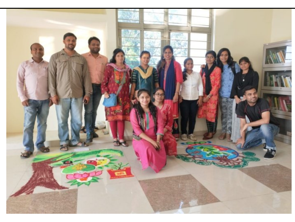
Group photo with Volunteers and Participants of Rangoli