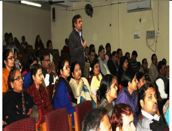
Participants clearing their queries with experts