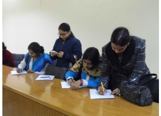
Participants filling Registration forms