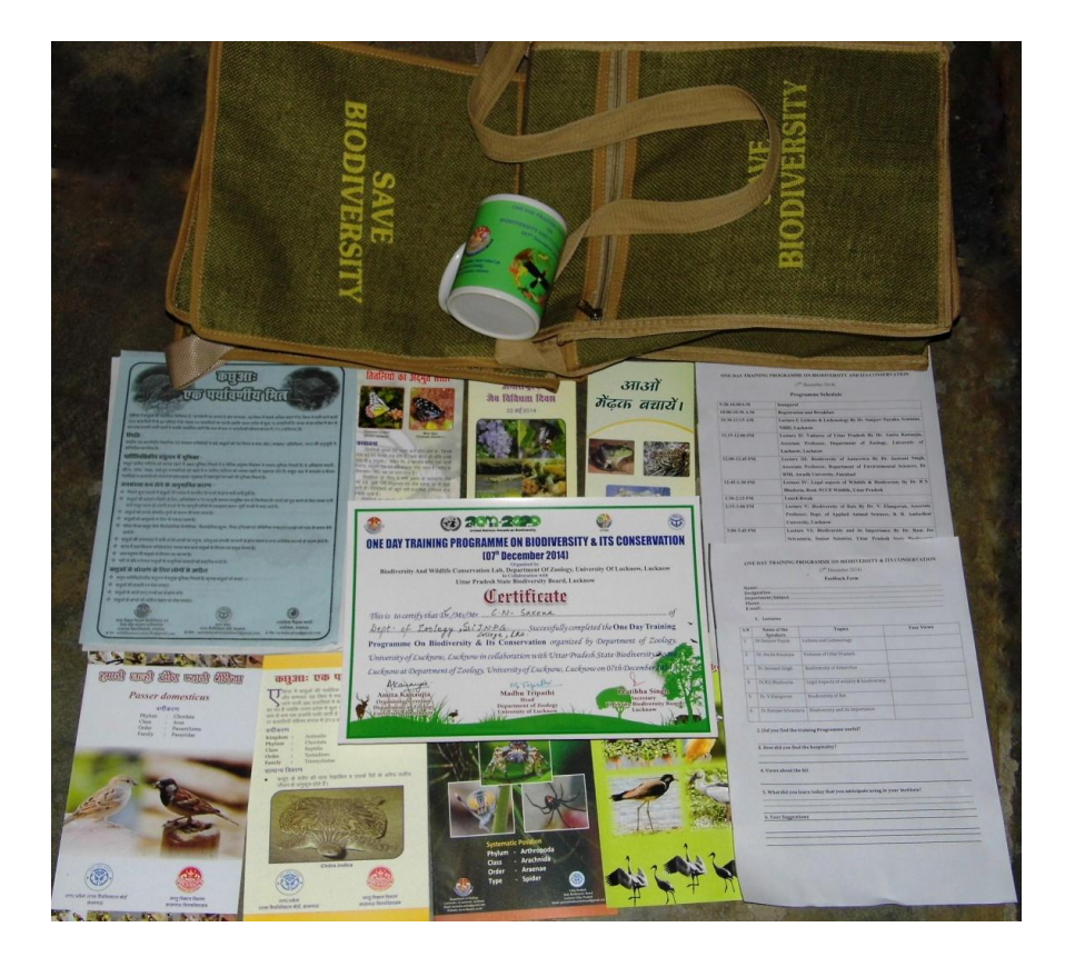
Kits provided to the participants