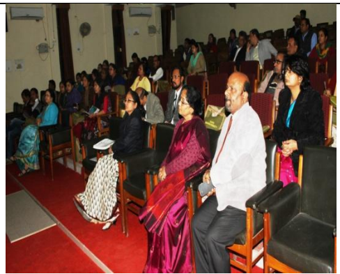
Participants attending lectures