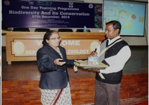
Memento presentation to Speakers