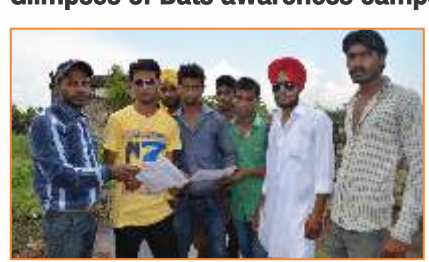
Bat conservation camp at Meerut in Gandhar