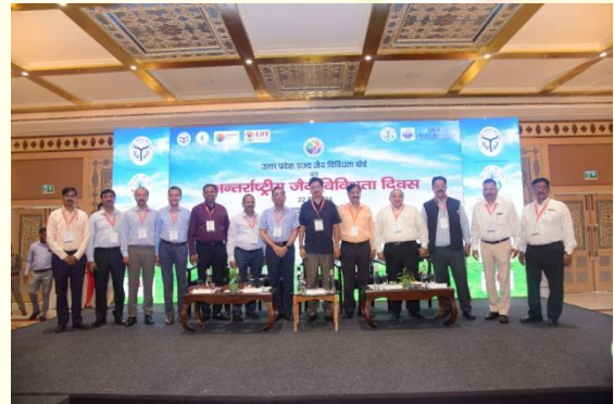
View of Chief Guest, Special Guest and Speakers at Dias