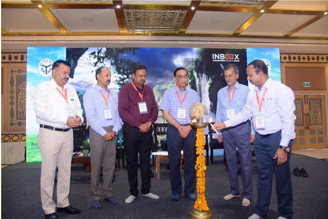
Lighting of Lamp by the Dignitaries at Dias

The programme started with lighting the lamp followed by welcoming the guests and the delegates.