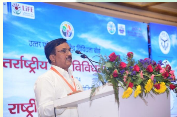
Representative from line department delivering Lecture