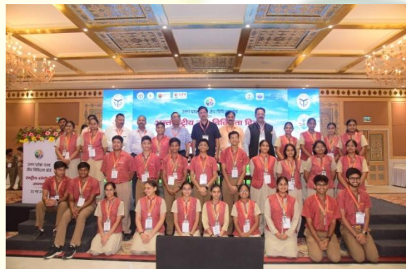
View of Students attending the IDB celebration