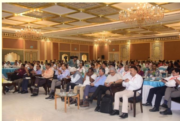
View of Audience