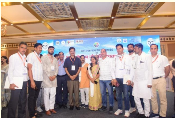
View of BMC Members attending the IDB celebration