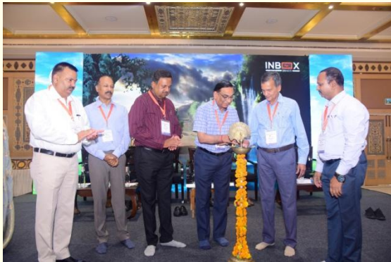
Lightening of Lamp by the Dignitaries at Dias