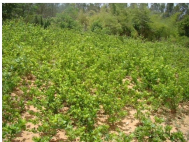
HDST Plantation of Premna integrifolia in Dist. Chittoor (AP)