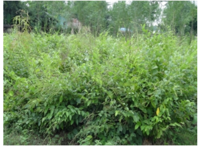
Pilot Scale Cultivation of Desmodium gangeticum in Dist. Hardoi (UP)

are losing basic interests in the sustainable resource management. Neither, they deploy any traditional skills in this direction.