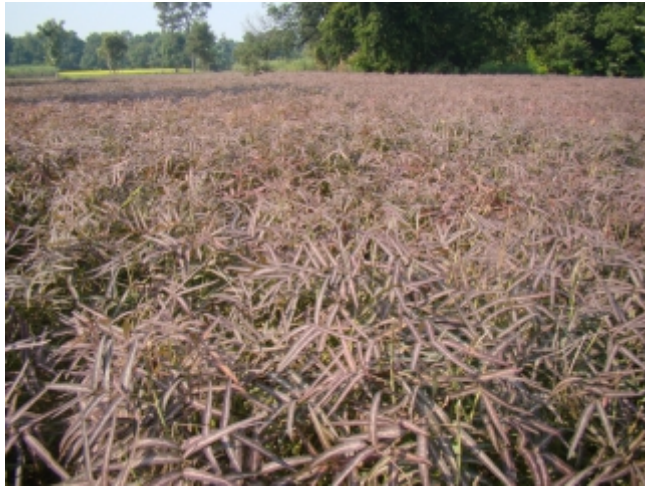
Cultivation of Uraria picta in Dist. Kushinagar (UP)