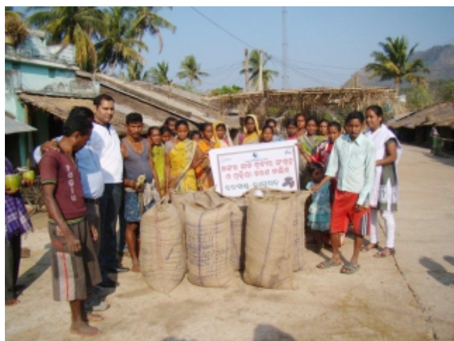
An Interaction Programme in OFSDP Project Site

species known to face conservation concerns. Hence, it covers only 6 species.