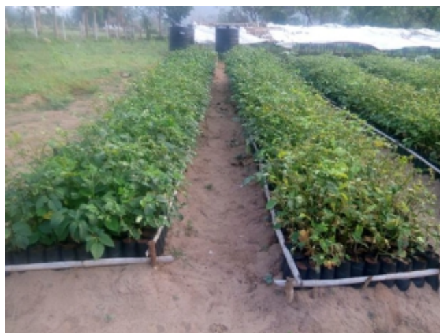
Nursery Phase for Oroxylum indicum plantations in Dist East Godavari (AP)